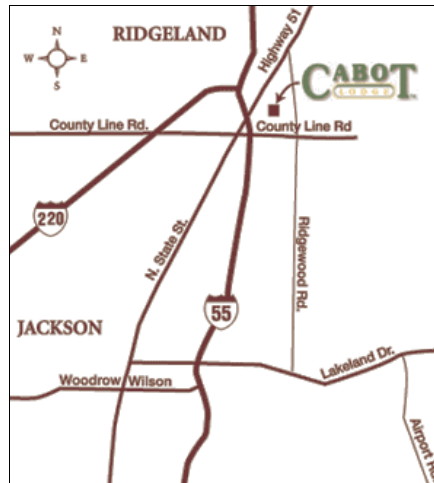
Mississippi Licensed Professional Counselors Association